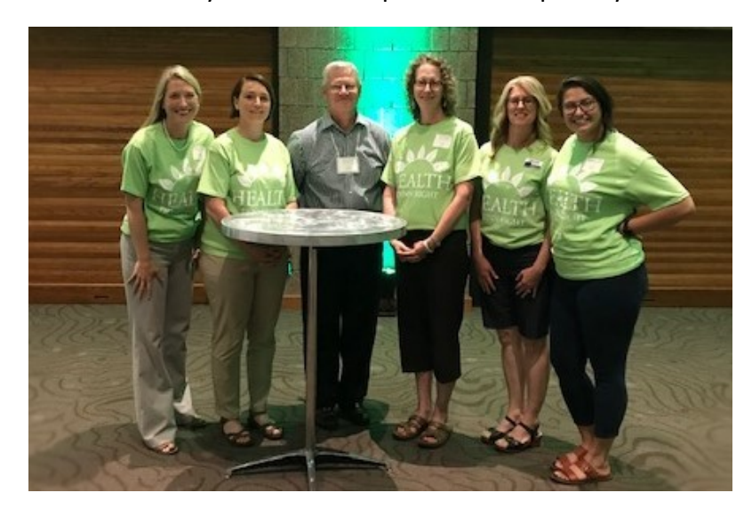
The conference planning team for the Dunn County CHNA Reveal and launch of the Health Dunn Right Coalition.

These findings were presented to over 140 community members as part of the Dunn County CHNA Reveal and Health Dunn Right Symposium at UW-Stout in July, 2019. In addition to the community survey results and the quantitative data, comments from the community survey were shared for each of the top health areas. Breakout sessions included time to dive into the data and begin framing plans for a community health action plan for each priority area.