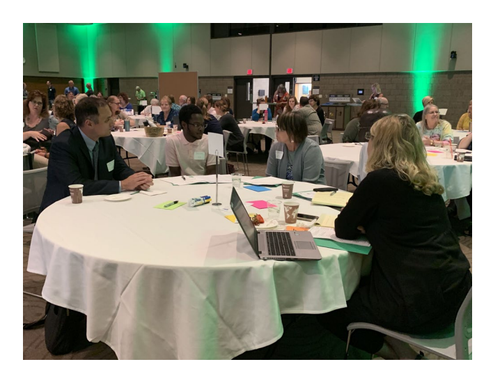
Table discussions at the Dunn County CHNA Reveal and launch of the Health Dunn Right Coalition at UW-Stout in July, 2019.